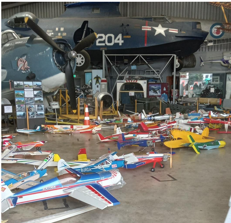
Some of the models for sale at the Tauranga auction

The Tauranga auction was held on the 12 th at the Classic Fliers Museum As usual there was a large selection of models changing hands at reasonable prices however engines and radio gear were almost impossible to sell.