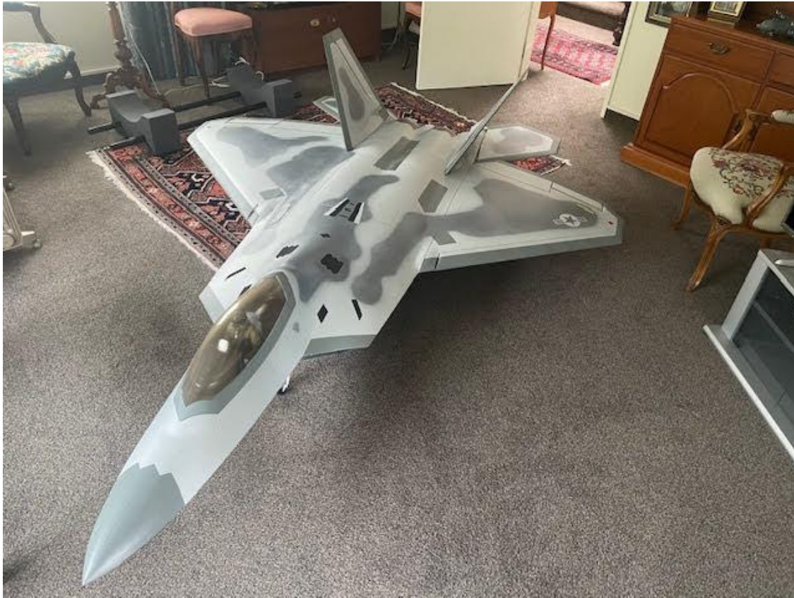
The lounge is too small in this case, Top Gun, eat your heart out!