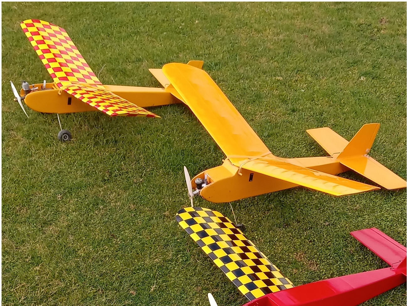
A Flock of Hummingbirds

The plan shows 100mm dihedral under each wing tip. This makes for a very stable free flight model but for R/C use we found 65mm under each tip makes for much smoother flying.